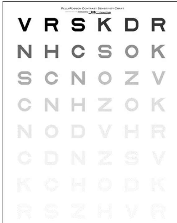
Figure 2. Pelli-Robson contrast sensitivity chart (Precision Vision, LaSalle, IL) 11 The Pelli-Robson contrast sensitivity charts have uniformly large (20/680 Snellen equivalent size) letters of decreasing contrast in a series of triplets. There are two triplets per line and all letters within each triplet have the same contrast level. The Pelli-Robson chart is read at 1 m. It is wall or easel mounted; therefore, luminance of the environment must be accounted for when used for research.

Reprinted with permission from Pelli et al. 11 Copyright © 2014 D.G. Pelli and J.G. Robson. Manufactured by Precision Vision.